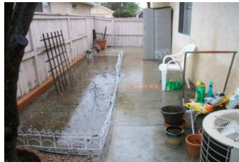
Water is pooling along side yard

Comments: • Low area that will cause pooling / ponding • Negative drainage was observed